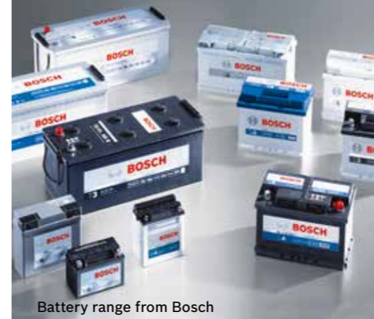
Battery range from Bosch