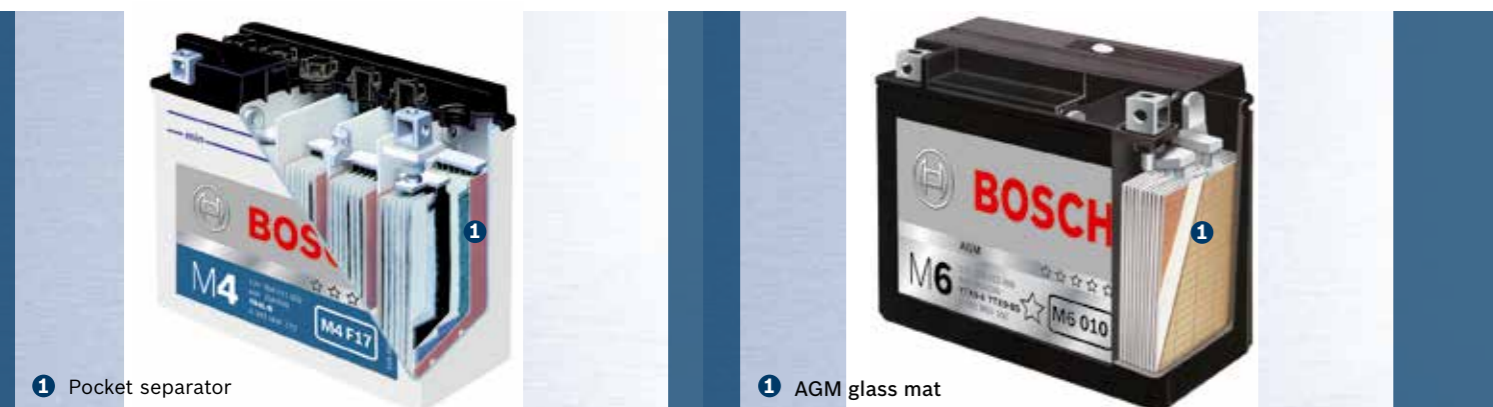
1 Pocket separator

AGM (Absorbent Glass Mat) technology: The electrolyte is fully bonded in a glass mat, thus providing three times better deep cycle resistance than conventional batteries. Total safety: Fine mesh flame trap, sealed, completely leak-proof and no escape of electrolyte.