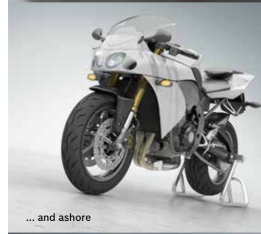
... and ashore