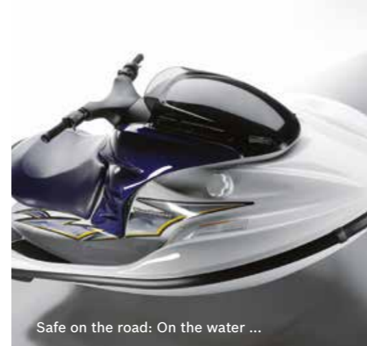
Safe on the road: On the water ...

Bosch also offers the battery charger C3 (SNR 0189999030) and C7 (SNR 0189999070)!